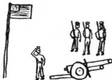
DADDY SERVING IN THE ARMY

Soon Daddy had to go in the Army and after being at Fort Gordon, Georgia, and Fort Devens, Massachusetts, he was sent overseas to Frankfurt, Germany.