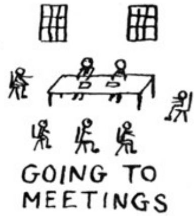
GOING TO MEETINGS