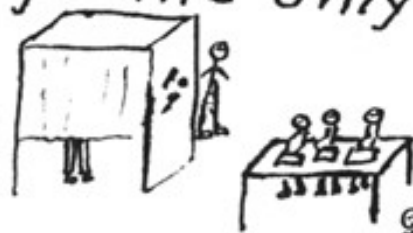
VOTING ON ELECTION DAY

in this campaign. We have two telephone numbers at our house now, GR6-3460 and TA2-3576, and so I hope that you will call Daddy up and talk to him about this important election that is coming up on November 8th. Daddy ran for the House of Delegates four years ago and only lost by 32 votes. I