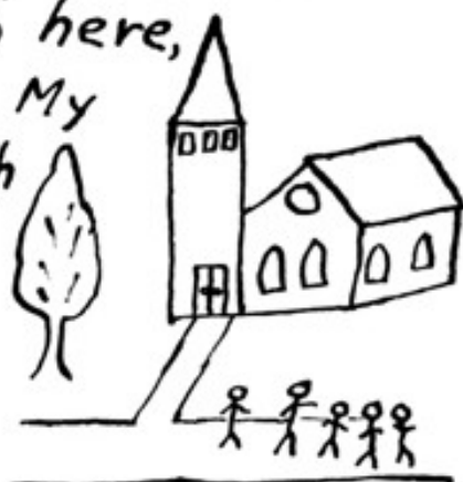
GOING TO CHURCH

Once every month, Daddy goes to the meeting of The Trappe